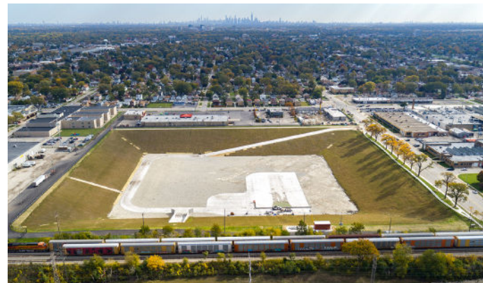
MWRDGC Addison Creek Reservoir Project

Whether you require consulting for an individual project or the full-service resources of our team, you can rely on CBBEL to take the time to thoroughly understand your needs and partner with you to create innovative, cost-effective solutions. From grant writing and design procedures to record-keeping and funding reporting, CBBEL is your full-service team.