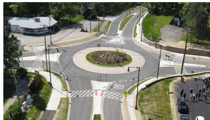
Algonquin Main Street Reconstruction Project